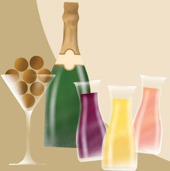
MIMOSA TRAY ... $20 Bubbly, Juices, Donut Holes