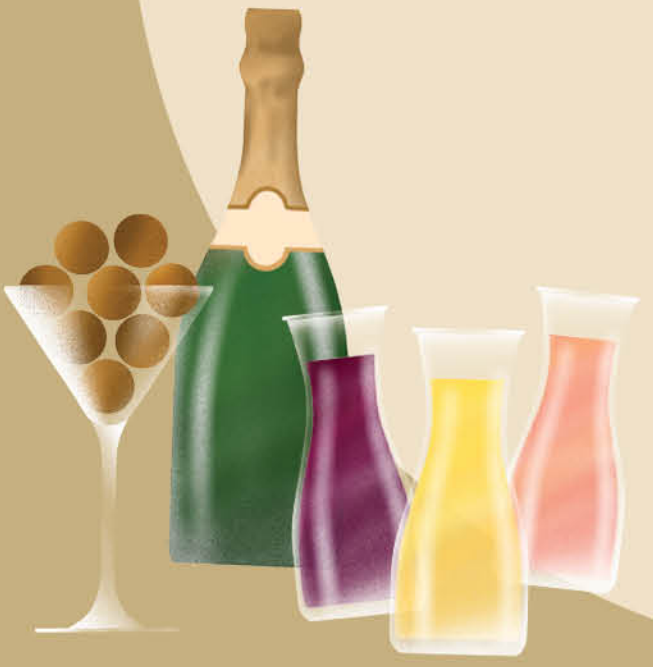
MIMOSA TRAY ... $20 Bubbly, Juices, Donut Holes